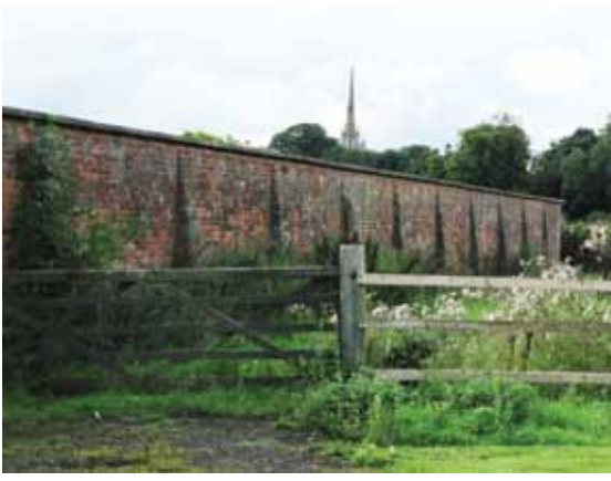
View from walled kitchen garden towards St. Bartholomew's