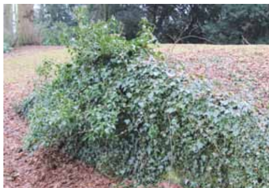
The Icehouse, Hewell Park

The recent sale of some of the properties within the village to individual occupiers has raised concerns that these buildings may suffer alterations which undermine their architectural importance. The imposition of an Article 4 Direction was considered which would remove permitted development rights from some buildings. This means that planning permission would then be needed for any external alterations on elevations fronting the highway. However PPS5 advises that an Article 4 direction should only be applied where permitted development rights undermine the aims for the Conservation Area. The level of past alterations is minimal and the risk of significant decay in the near future is low, therefore it was decided not to apply an Article 4 Direction at this time but this could be reassessed in the future.