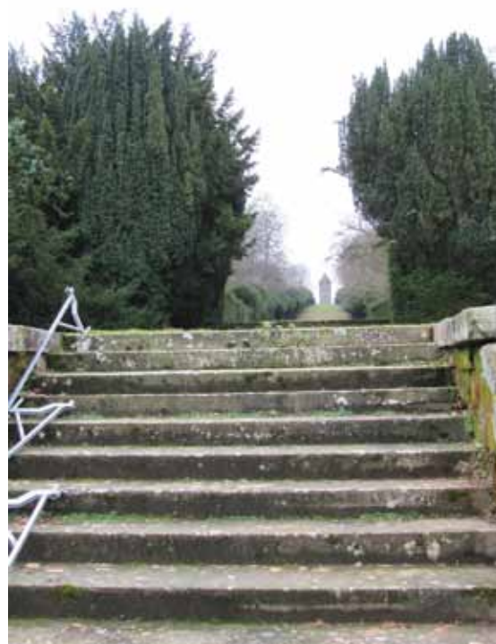
View from French garden up to water tower, Hewell Park