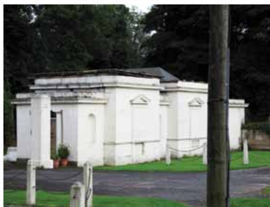
South Lodge, Hewell Lane