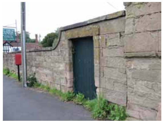
Wall to Tardebigge Court