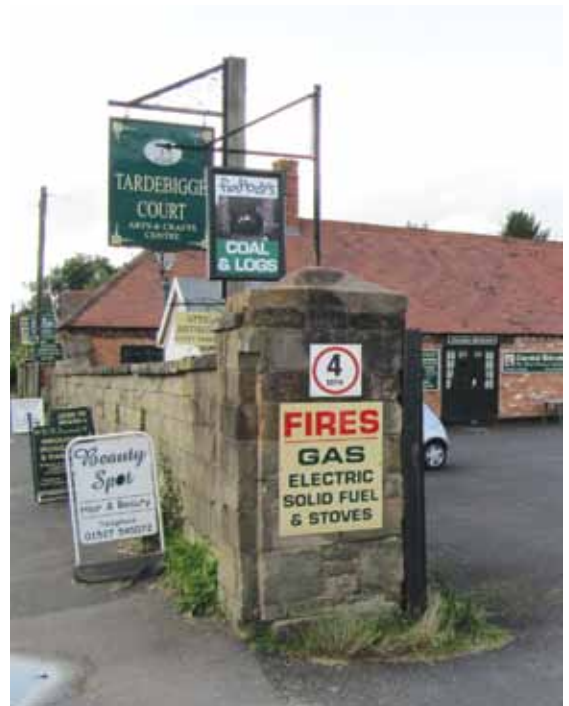
Signage at Tardebigge Court