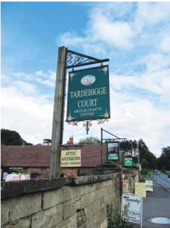
Tardebigge Court, Hewell Lane

The Hewell Grange Conservation Area includes the area currently designated as a Registered Historic Park, the immediate surroundings of the former Paper Mill and Kennels to the Southeast of the prison, and the properties within Tardebigge village. This boundary was suggested and supported by the Victorian Society and the Hereford and Worcester Gardens Trust, to encompass what remains of the historic Hewell Grange estate. A map of the Conservation Area boundary is attached as Map 1, a map of the existing registered historic park boundary is attached as Map 2.