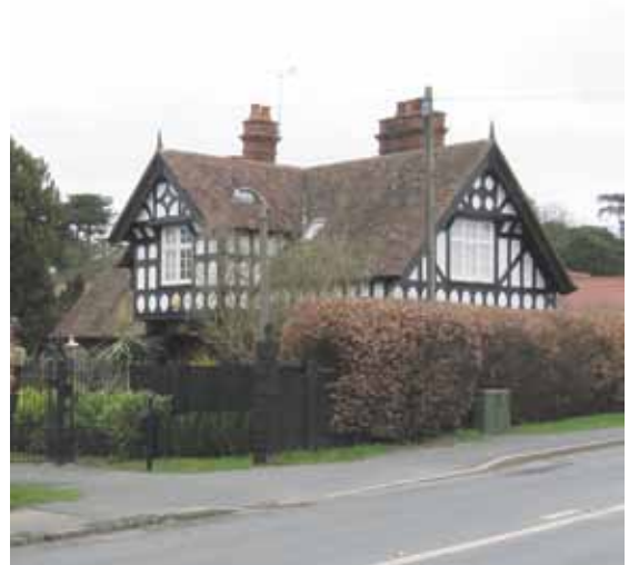
Dairy Cottage, Hewell Lane