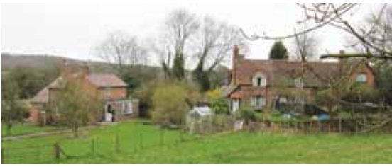
Old Papermill Cottages, off Hewell Lane