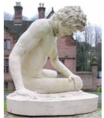
Statue of the Fallen Gladiator, Hewell Park

Beyond the French Garden leading upwards towards Hewell Lane are the remains of the grass steps leading to the Grade II listed water tower. This building is prominent in views up Hewell Lane from Tardebigge village, and also within the registered historic park - although its setting has been undermined by the partial loss of the grass terraced steps below. The water tower was built in 1891, designed by architects Bodley and Garner who also designed the main house, and is four storeys high constructed in red sandstone with a pyramidal shingled roof. No longer in use, the structure is showing signs of decay with missing tile hanging and roof tiles. The windows have also all been lost, with only some small sections of the metal frames still in place, and the openings blocked at ground floor level.