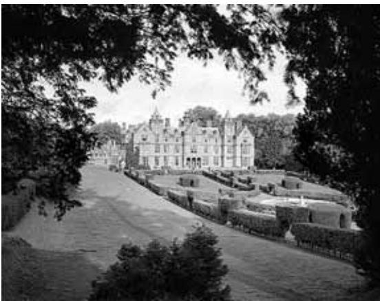
Hewell Grange garden front 1905.