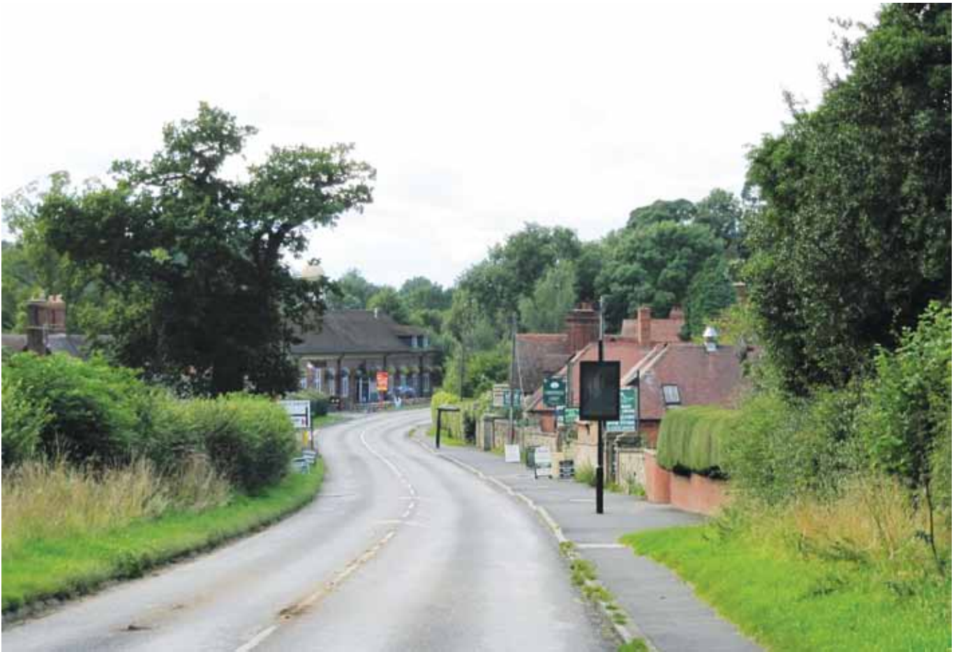
View through village