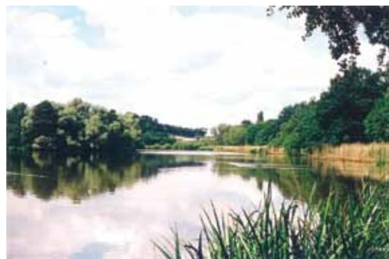
The lake, Hewell Park, ©Parklands Consortium Ltd 2001

2.6 The lake to the north of the Conservation Area is designated as a Site of Special Scientific Interest (SSSI). This designation includes the lake, the eastern and south eastern lakeside woodlands and the mixed ornamental woodlands to the SE of the Grange and SW of the lake. Again this brings no additional planning controls, but consent is needed from Natural England for certain types of works. Part of the SSSI is managed by the Worcestershire Wildlife Trust as a nature reserve because of its importance for breeding and wintering water birds.