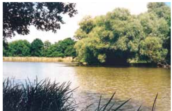
The Lake, Hewell Park