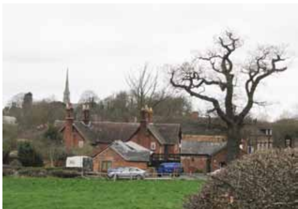
View across The Forge to St. Bartholomew's

Tardebigge as a settlement can be traced back to the 10th century and various versions of the name are recorded. The name can be translated as 'tower on the hill' - a possible reference to an earlier ecclesiastical building on the site of St. Bartholomew's Church. The majority of the manor including the previous church was given to the Cistercian Monks at Bordesley Abbey c.1138 and reportedly grew to a much larger settlement through the medieval period. The medieval church was demolished in 1775 and replaced with the current Grade II listed church in 1777 incorporating much of the earlier fabric.