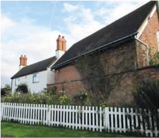
Gardeners Cottage and Apple House, Holyoakes Lane