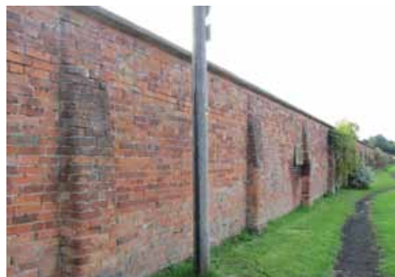
Walled kitchen garden, Holyoakes Lane

2.5 A large proportion of the proposed Conservation Area is within a Grade II* registered historic park. Although this designation brings no additional planning controls, the special interest of the park is a material consideration when the Council assesses any applications for planning permission. The Garden History Society must also be consulted on any planning applications which could affect its special interest.