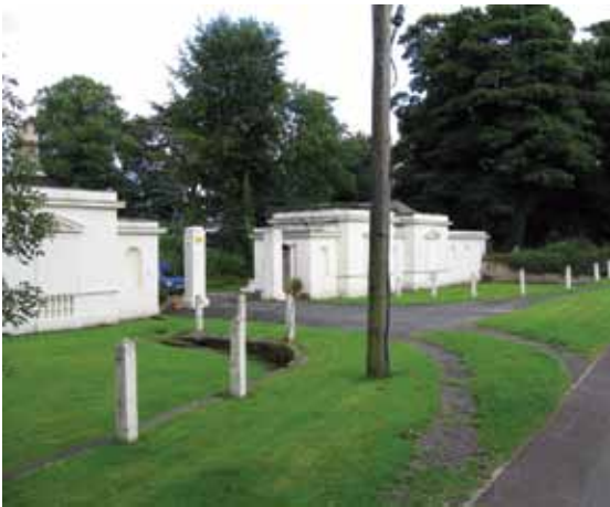
North and South Lodges, Hewell Lane