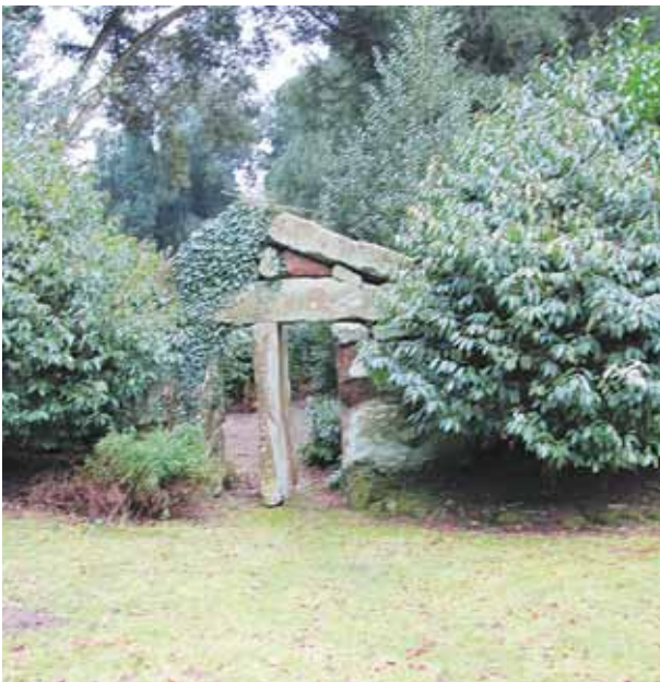
Swing door and portal, Hewell Park

The Hewell Grange Conservation Area contains 17 listed buildings and structures, most of which are within what is now the prison estate. There are also a large number of ancillary structures (approximately 30) such as boundary walls and statuary which are protected as curtilage listed buildings. Any structure constructed pre-1948 which is ancillary to a listed building is automatically protected as curtilage listed. A draft list of all the curtilage structures which have presently been identified within the prison estate has been included in Appendix 2. Please note there may be other protected curtilage structures concealed within the estate which are still covered by the listed status.