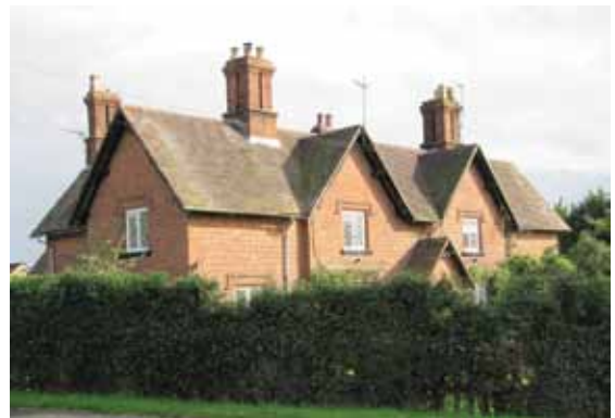
Rose Cottages, Hewell Close