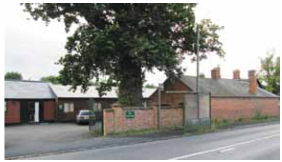
The Forge, Hewell Lane

On the opposite side of Hewell Lane facing the entrance to Hewell Close are a pair of late 19th century lodge buildings, both unlisted. Southwest Lodge on the left was once the Works Foreman's Cottage and is by Goddard and Paget, who were prominent Victorian architects. Built in 1880, the decorative tile hanging with half timbered gables and carved brackets is typical of the period and the architects. On the right and mostly concealed from view is Hewell Dairy Cottage which was built in 1885 and has a slightly heavier style than Southwest Lodge. The single storey dairy building to the rear survives.