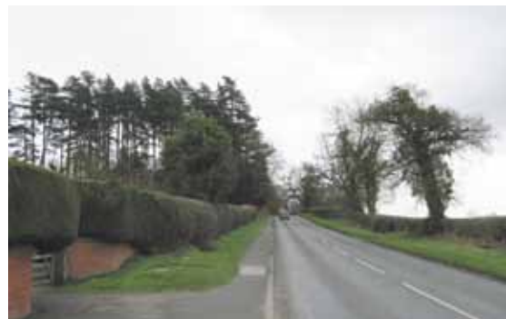
Hewell Lane, from Hewell House looking south-east

2.3 The primary legislation governing Listed Buildings and Conservation Areas is the Planning (Listed Buildings and Conservation Areas) Act 1990. This legislation includes certain statutory duties which the Council as Local Planning Authority must uphold. S69(1) of the Act requires Local Planning Authorities to designate any areas which they consider to be of special architectural or historic interest as Conservation Areas, and under s69(2) to review such designations from time to time. The Council has a further duty under s71(1) to formulate and prepare proposals for the preservation and enhancement of its Conservation Areas from time to time.