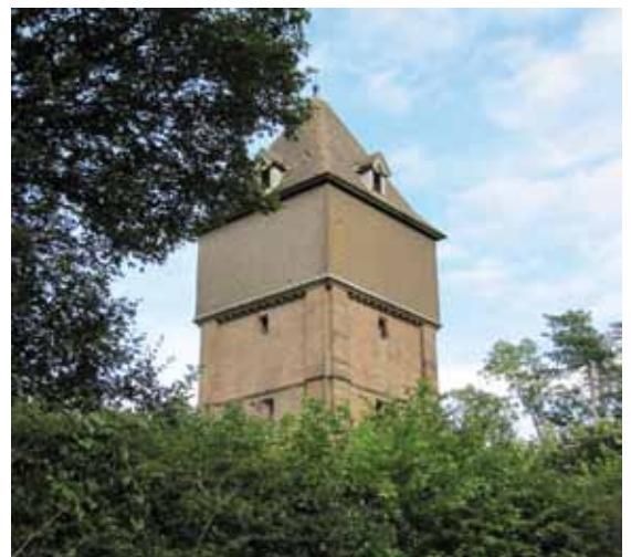
View of water tower from Hewell Lane

Beyond the French Garden leading upwards towards Hewell Lane are the remains of the grass steps leading to the Grade II listed water tower. This building is prominent in views up Hewell Lane from Tardebigge village, and also within the registered historic park - although its setting has been undermined by the partial loss of the grass terraced steps below. The water tower was built in 1891, designed by architects Bodley and Garner who also designed the main house, and is four storeys high constructed in red sandstone with a pyramidal shingled roof. No longer in use, the structure is showing signs of decay with missing tile hanging and roof tiles. The windows have also all been lost, with only some small sections of the metal frames still in place, and the openings blocked at ground floor level.