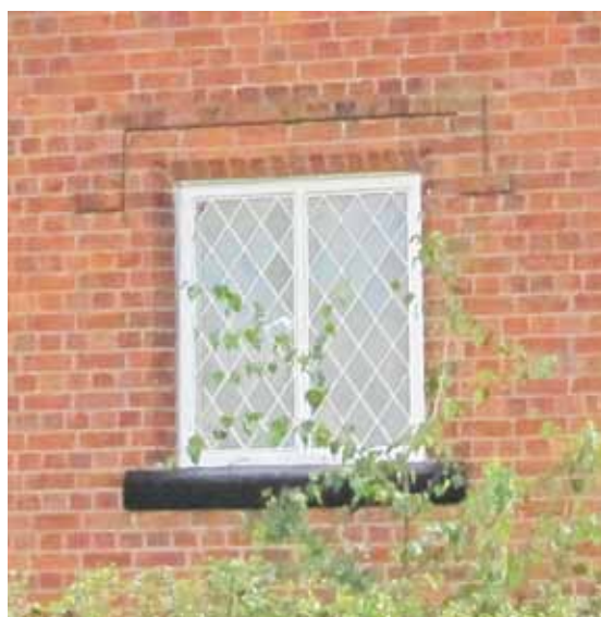
Leaded window, Hewell Lane