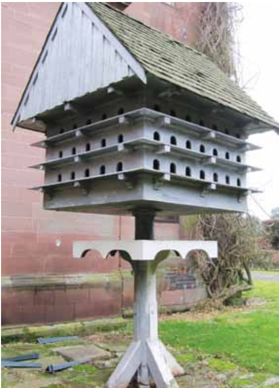
Dovecote to rear of Hewell Grange

3.2 The Hewell Grange Conservation Area is significant because of the high number of listed and unlisted historic buildings, and the connection between the wider landscape and the built environment. As a historic entity the inter-relationship between the setting of the listed buildings and the registered historic park is a key element of the special interest of this Conservation Area. Some fragmentation has occurred as the original estate has been sold in parcels to individual owners; however this has been largely mitigated by the passing of the bulk of the park into Crown ownership.