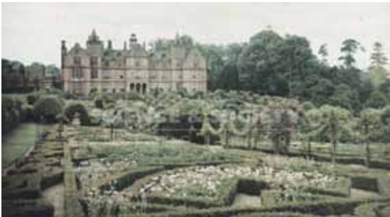
Hewell Grange garden front c.1910, Arthur E Morton