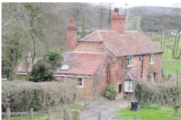
Old Papermill Cottage, off Hewell Lane

The Hewell Grange estate was once one of the largest private estates in Worcestershire and the seat of the Earl of Plymouth, until it passed into crown ownership in 1946. The site was originally part of the grange connected to Bordesley Abbey, passing to the Windsor family after dissolution of the monasteries in 1542. The manor remained in the Windsor family, later the Earls of Plymouth from the 17th century, with successive generations adding to the evolution of the house and the landscape. Most of the surviving historic buildings date from the 18th and 19th century, with a few incorporating earlier structures such as the ruins of the Old Hall. The park itself has been expanded and altered in several phases throughout the ownership of the Earls of Plymouth, including the enlargement by 1000 acres and introduction of deer in 1561 and formal gardens laid out in the 19th century. The evolution of the park is described further in section 4.8.