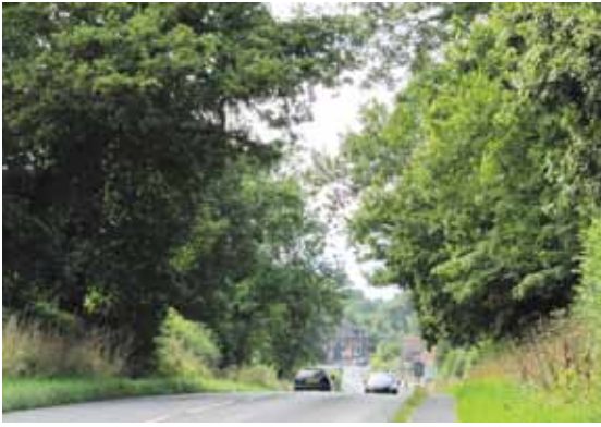
View from water tower towards Tardebigge PH