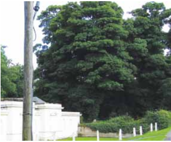
Trees at South Lodge, Hewell Lane

2.7 The Council is empowered under the Town and Country Planning legislation to protect the environment within the district by placing Tree Preservation Orders on trees and groups of trees where it is in the public interest to do so. The Council regularly makes such orders and a group order was placed on the Hewell Estate a few years ago and has recently been revised. It is an offence to carry out any work to protected trees without the formal consent of the Council.