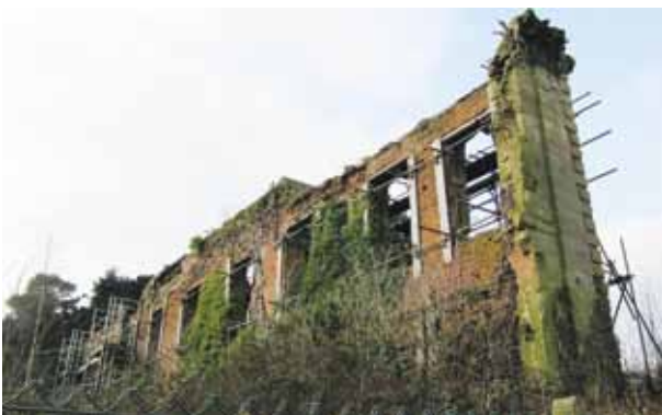
Ruins of The Old Hall, Hewell Park

The ruins of the Old Hall (Grade II listed) which was substantially demolished in 1899, survives to the east of the present house and is included on the Councils Buildings at Risk register because of its deteriorating poor condition. The building was a 1712 reworking of an earlier 16th century manor house with later 19th century additions, but only the front elevation and part of the side and rear walls survive. The front pedimented portico depicting the Plymouth coat of arms with Corinthian columns demonstrates the grandeur of this once fine building, now in perilous condition and permanently scaffolded.