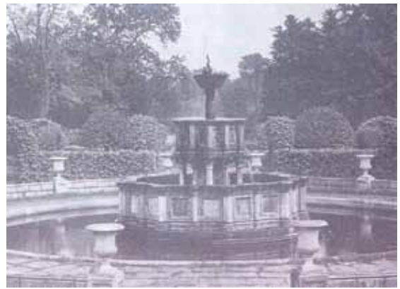
Fountain in French garden, date unknown.

Much work was done in the grounds once the new house was complete, and a major piece of landscaping was the creation of a series of eighteen grass terraces from the water tower to the edge of the lake. The terraces ran for 650 yards and took three years from 1900 to 1903 to construct. The cutting of the grass terraces from the water tower at the highest point of the site and stepping down to the lake in the valley below, creating a marvellous cross axis. With the French garden at its centre it succeeded in heightening both the formality and drama of the site, but their previous continuation towards the lake on the other side of the garden has been erased. The maze was started in 1902 near the top of the grass terraces and required considerable levelling. It was made of hornbeam and gravelled with white granite and a birch plantation was established near it in 1906. Rhododendrons were also extensively planted in the area of the planted hill in view of the indoor Tennis Court. Further planting, including the Lime avenues in the park, is associated with the building of the new mansion and was carried out between 1895 and 1914."