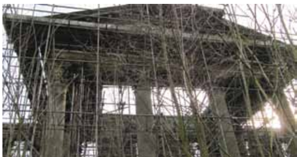
Ruins of The Old Hall, Hewell Park

Hewell Park was included on the National Heritage at Risk register in 2009 (one of only 2 Parks at Risk in Worcestershire) because of ongoing significant condition problems and is categorised in the register as having high vulnerability. The Hereford and Worcester Gardens Trust are seeking to address these problems, commissioning a Landscape Appraisal in 2001 and coordinating the recent restoration of the island to the lake and iron bridge, which was carried out by HMP Hewell staff and prisoners.