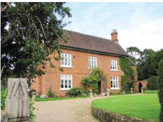
Hewell House, Hewell Lane

Details of all the listed buildings within the Conservation Area boundary are included in Appendix 2. The statutory list descriptions for these are available online through the Heritage Gateway website at www.heritagegateway.org.uk/gateway/