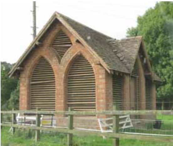
Gamekeepers larder at Hewell Kennels