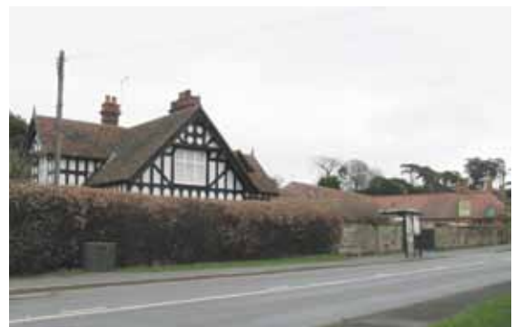
Dairy Cottage and Tardebigge Court