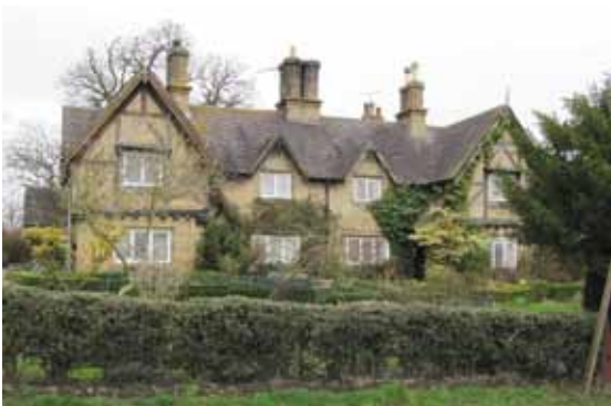
Park Cottages, Hewell Lane

The walled kitchen garden on Holyoakes Lane (now the Prison kitchen garden and shop) was laid out in 1827 and enclosed by a 3m high red brick wall in 1833. This site was once part of Holyoakes Farm, but relocated the kitchen garden away from the main house to allow the creation of the French garden in 1827. Attached to the walled garden facing Holyoakes Lane, is the much altered former Head Gardeners Cottage (pre 1838) and Apple Store (1850s) which interestingly resembles the typical design of a non conformist chapel. Within the walled garden a number of historic structures survive including one 1830s glasshouse, an 1840s Melon Pit, an 1840s Root House and a series of single storey outbuildings also dating from the 1840s. The kitchen garden was added to the registered park in 2001, it is also proposed that the walled garden be submitted for statutory listing in recognition of its architectural and historic interest.