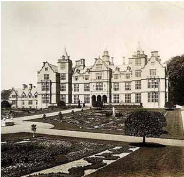
Hewell Grange garden front 1891, H. Bedford Lemere. Reproduced by permission of English Heritage. NMR

The main prison building at Hewell Grange is a Grade II* listed former country house built in 1885-1892 to replace what is now known as the Old Hall - itself a remodelling of a 16th century manor house. This large imposing building is in a 'Jacobethan' style popular in the late Victorian period but with an Italianate interior, designed by Bodley and Garner and constructed in Cheshire Red Sandstone. The heavy form of the building is lightened by the large mullioned windows and addition of turrets, ornate chimneys and an octagonal cupola at the upper levels. Most of the lavish interior survives with ornate panelling, decorative plasterwork ceilings and a galleried entrance hall with marble pillars.