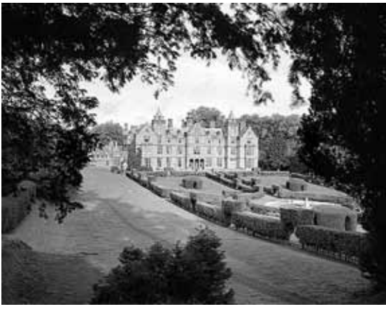
Hewell Grange garden front 1995.

The gardens and park at Hewell Grange are in fact the most recent manifestation of a history of landscaping undertaken at the behest of the Earls of Plymouth. Among the most outstanding elements of the history still visible on the site are the improvements to the lake undertaken at the advice of William Shenstone; the lakes later remodelling with extensive tree planting undertaken by Lancelot Brown in the second half of the 18th century and the continuing enhancement of the pleasure grounds and park in the early 19th century by Humphrey Repton. The improvements also embrace the architectural improvements undertaken after 1815 by Thomas Cundy (Snr), firstly to the house and possibly including the creation of the Real Tennis Court. Further ornamentation to the pleasure grounds and the creation of extensive formal gardens were completed during the 19th century, culminating in improvements undertaken at the end of the century and beginning of the 20th century in conjunction with the design for the new house by Bodley and Garner, constructed between 1884 and 1891. Much of the historic design in terms of circulation patterns, structures, details of surface finish, planting and water features, has been eroded, replaced, or is in poor condition