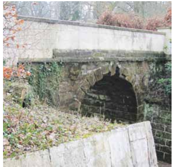
Sandstone bridge, Hewell Park

To the rear of the main house is the Grade II listed Tennis Court (now in use as the prison gym) which was originally built in 1820 with alterations to raise the roof and add dressing rooms carried out in 1891. The prominent Grecian balcony supported by four Coade stone caryatids and stone balustrade is the strongest architectural feature, on what is otherwise a rather restrained design. The porticoed entrance on the south west corner and the vestibule on the southern elevation have unfortunately been demolished. A set of stone steps dating from the 1830s, lead down to the Dutch garden from the tennis court to the south. The sandstone bridge to the South of the Tennis Court dates from the 1820s and although the original balustrade has been lost, this structure still has historic merit and is protected as curtilage listed. Beyond this a large Coade stone urn on a grey sandstone pedestal survives. Adjacent to the tennis court are the former stables, now used as offices by the Prison Service Works Department. The building is curtilage listed and reputedly dates from the 1680s but has been extensively altered.