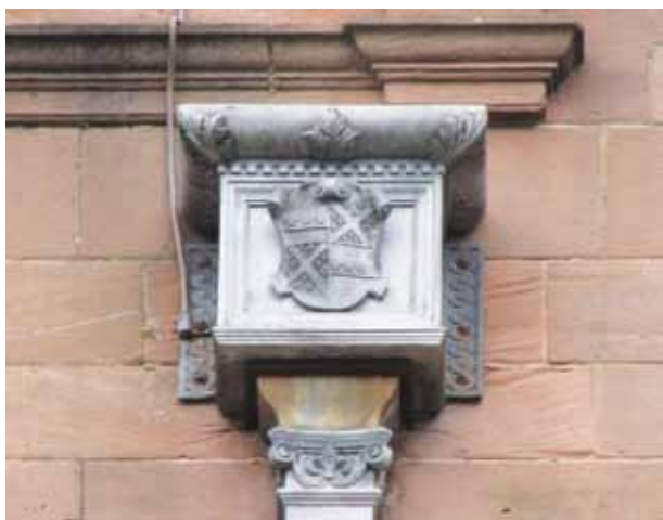
Windsor family coat of arms

Tardebigge as a settlement can be traced back to the 10th century and various versions of the name are recorded. The name can be translated as 'tower on the hill' - a possible reference to an earlier ecclesiastical building on the site of St. Bartholomew's Church. The majority of the manor including the previous church was given to the Cistercian Monks at Bordesley Abbey c.1138 and reportedly grew to a much larger settlement through the medieval period. The medieval church was demolished in 1775 and replaced with the current Grade II listed church in 1777 incorporating much of the earlier fabric.