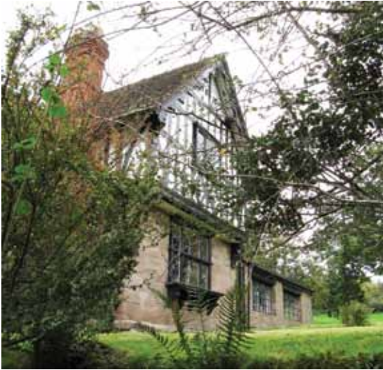
Papermill Lodge, off Hewell Lane