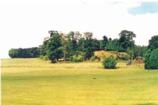
View across Hewell Park, ©Parklands Consortium Ltd 2001