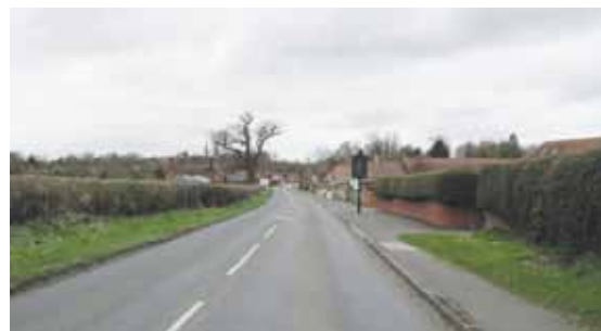
Hewell Lane, looking north-west

There are a number of key views across the landscape which demonstrates the intrinsic value of the historic park and its relationship with the historic buildings on the estate. Prominent views through the village include from the crest of Hewell Lane at the listed water tower down past the Home Farm (now Tardebigge Court) to the Tardebigge PH, and from the opposite direction leading from the listed gate lodges towards the pub. Within what is now Crown land, the approach to the Grade II listed Hewell Grange through the listed gate piers is of high significance along with the views from the garden elevation of the Grange through the French Garden. Views of the water tower up the grass steps have landscape significance as well as contributing to the setting of the listed tower, but have unfortunately been undermined by the loss of some of the steps which originally led as far as the lake. Other views include the grouping formed within Home Farm and the relationship between the various ancillary garden buildings, particularly within the Quarry Garden up towards the Grange beyond. The key views within the Hewell Grange Conservation Area have been identified on Map 1.