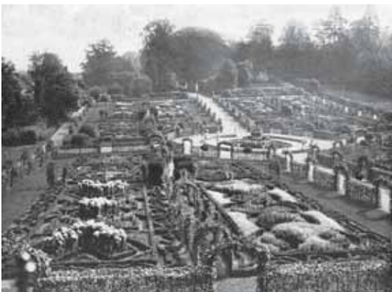
Parterres, date unknown.

There is considerable evidence of Brown's work still visible, particularly in the shape and formation of the lake. The park was further enlarged to create a more spacious setting for this important feature, and Brown was asked to return again to establish an appropriate planting frame for the landscape. The size of the lake at Hewell would have taken several years to achieve both in scale (c. 30 acres) and its triangular shape with gentle contoured edge. Its shape appears typical of Brown's work and its naked banks characteristic of his style. The boundary walk broadens out at the southern end of the lake and continues onto the dam itself, a feature that is reminiscent of Brown's design for Wootton. The sluice tucked round the corner from the head of the lake and surrounded by beech trees also appears typical of Brown's technique