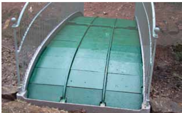
Iron bridge, Hewell Park 2009.