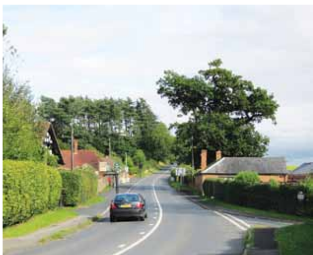
View of Hewell Lane looking Southeast